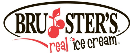
Bruster's Ice Cream

The Big Train will utilize a mobile ordering platform to eliminate crowded concessions lines and decrease person-to-person contact.